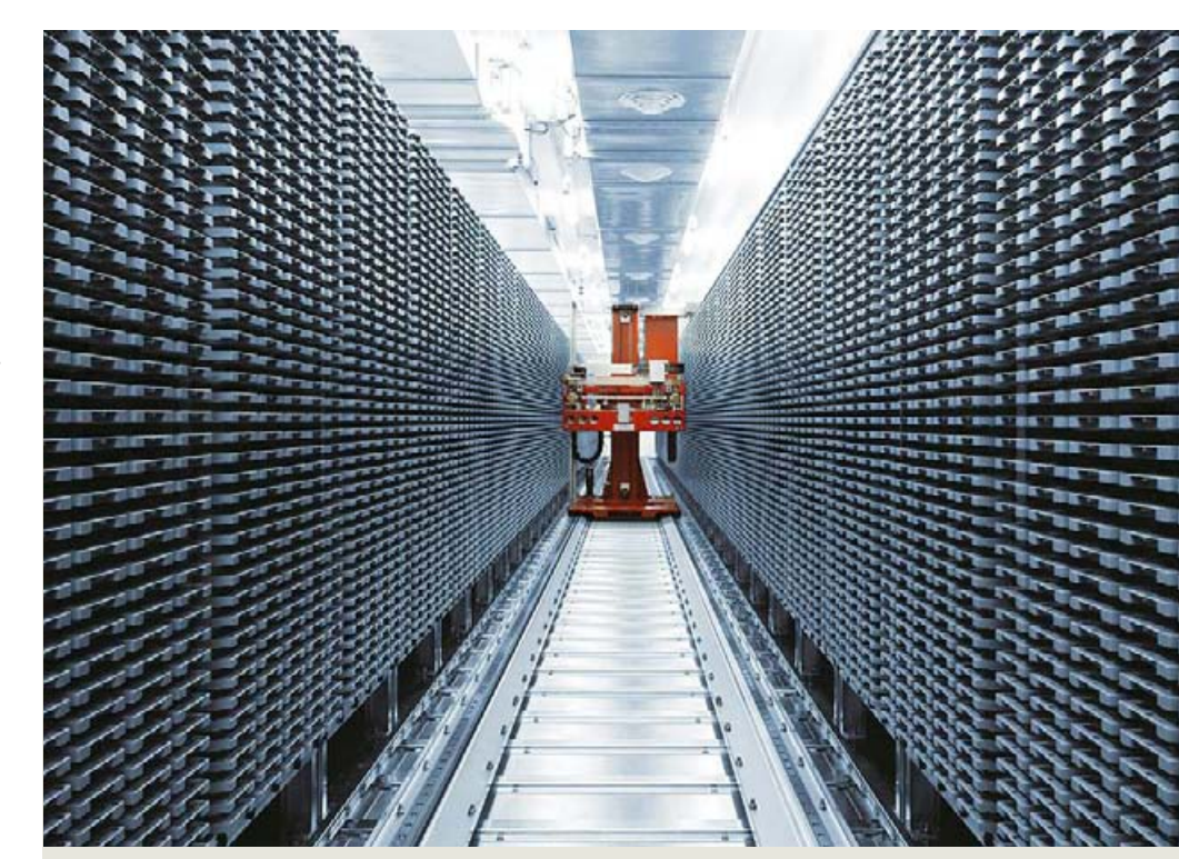
Central to our product range are the sample stores. REMP offers the ideal storage solution, whether for -80°C, -20°C or room temperature, for hundreds or millions of samples, vials or tube tacks, fully automated or manual.

At the end of 2005, we perfected the product portfolio and decided which products we want to bring to which markets. I am sure that product development will follow soon and I personally would say that the first step, the easiest step, would be to work at a software level. Once that step has been taken in principle, further development will almost certainly be driven by a need by a customer to fully integrate REMP and Tecan products with each other; a need, for example, to have a seamless system that takes samples from a store to a Freedom EVO® platform. From that process we will be able to make sense of how best to bring the technologies together for the market as a whole.