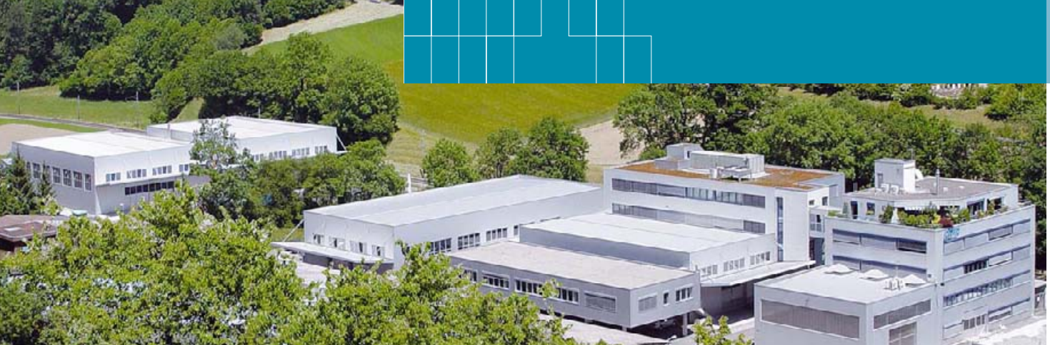
REMP's headquarters in Oberdiessbach, Switzerland

huge step for us. For this to happen effectively we have developed a clear structure to the product portfolio.