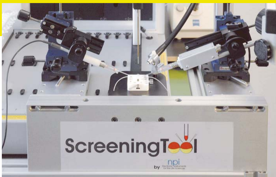
Automated, high speed ion channel screening with millisecond resolution