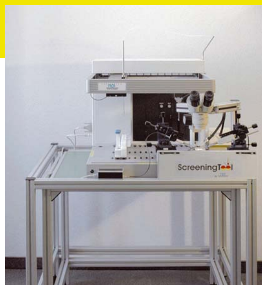
The Screening Tool is automated using Tecan's MSP9250