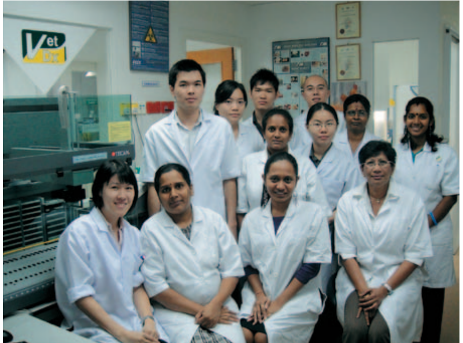
The Freedom EVO system is used extensively by both VFAD and APSN staff.

Tecan's Freedom EVO® platform is proving a valuable resource in the shared laboratory facilities of Vet Food Agro Diagnostics and Asia-Pacific Special Nutrients in Malaysia.