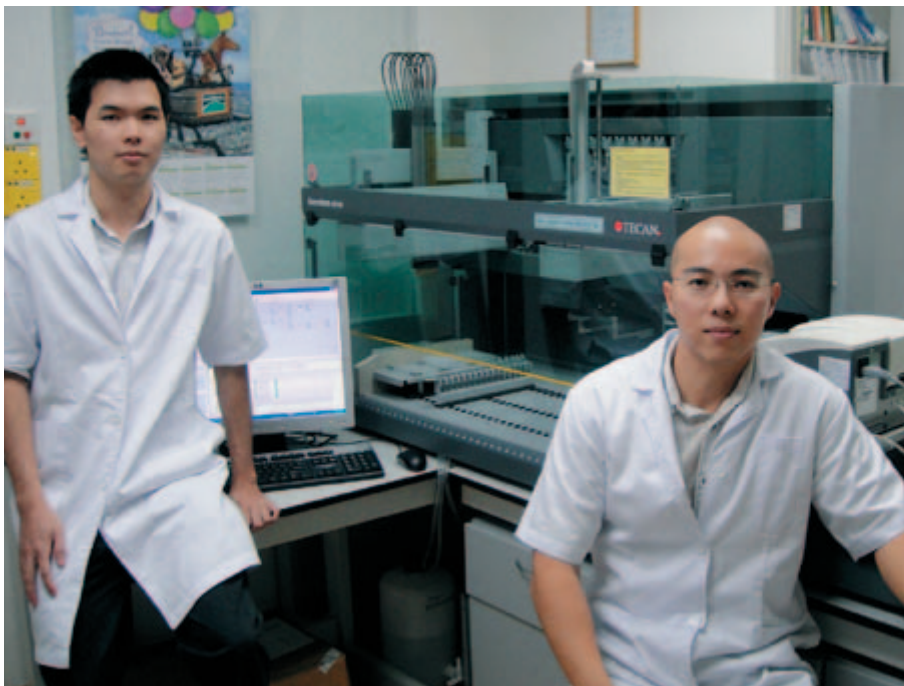
Automation allows multiple tasks to be performed in parallel, improving throughput.

Synbiotics is a registered trademark of Synbiotics Corporation.