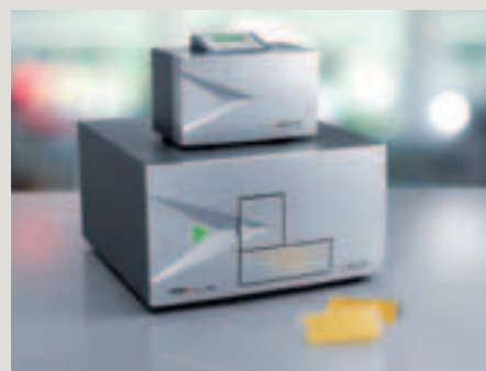
Infinite 200 PRO with Gas Control Module

To find out more on Tecan's Infinite 200 PRO and Gas Control Module, visit www.tecan.com/gcm