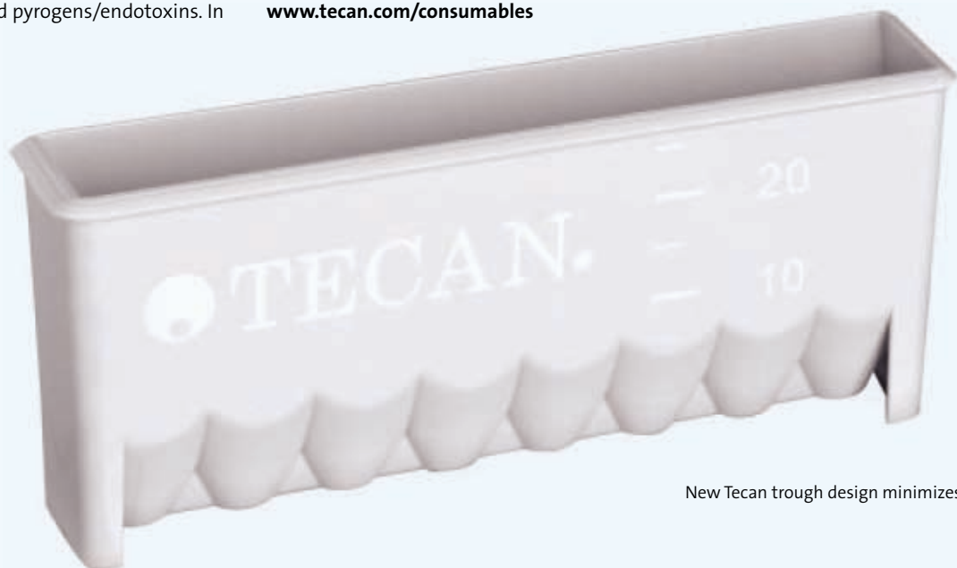
New Tecan trough design minimizes dead volume