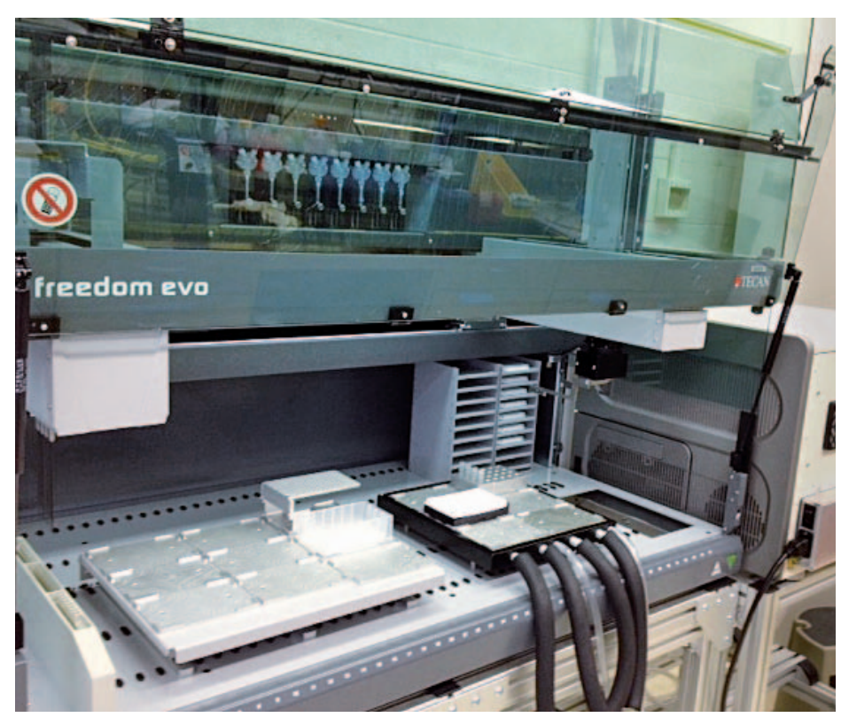
The Roche LC480 is linked directly to the Freedom EVO workstation

required per assay – effectively doubling the number of assays we can perform – with no loss of accuracy, and Tecan's engineers have been instrumental in realizing these benefits. As most of our experiments use very similar methods, Tecan worked with us to create a script for one of our more complex protocols when the platform was first installed, and spent several days training us to adapt and optimize it for our other assays."