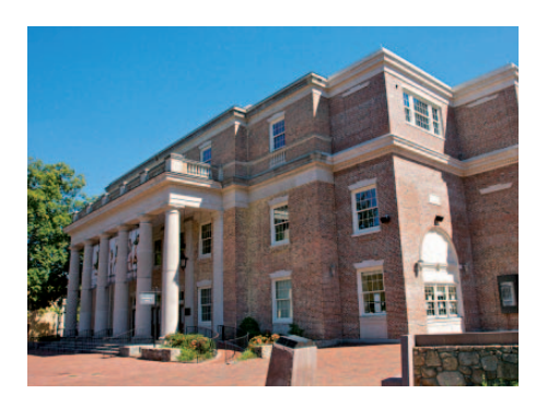
University of North Carolina

The Dittmer Lab relies on a Freedom EVO 150 workstation equipped with an eight-channel Liquid Handling (LiHa) Arm to ensure accurate and reliable assay plate set-up in a 384-well format. This platform is linked to a Roche LightCycler 480 Real-Time PCR System (LC480) to provide walkaway automation of qualitative and quantitative nucleic acid detection by real-time PCR. Pauline continued: "This set-up gives us the ability to perform automated analysis of up to 750 gene sequences per sample in just one day, allowing us to, for example, look at the whole miRNA library following infection with the virus. Before purchasing the Freedom EVO platform we used a basic, single channel pipetting robot, which was not capable of reliable automation on the scale required for this kind of investigation, and required manual transfer