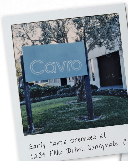
Early Cavro premises at 1234 Elko Drive, Sunnyvale, CA