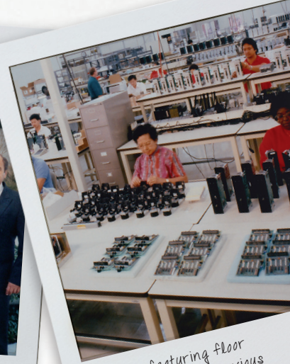
The manufacturing floor at Tecan Systems' previous Humboldt Court premises