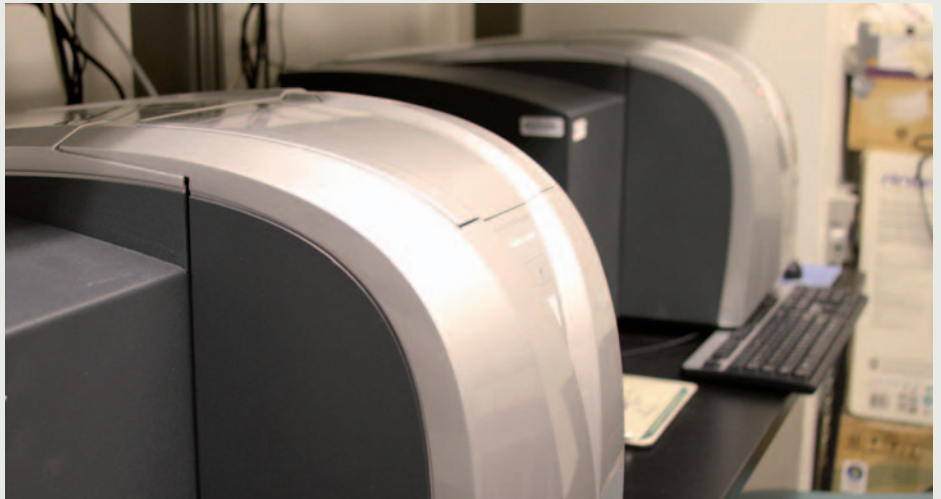
The Center’s PowerScanners provide reproducible, high throughput scanning