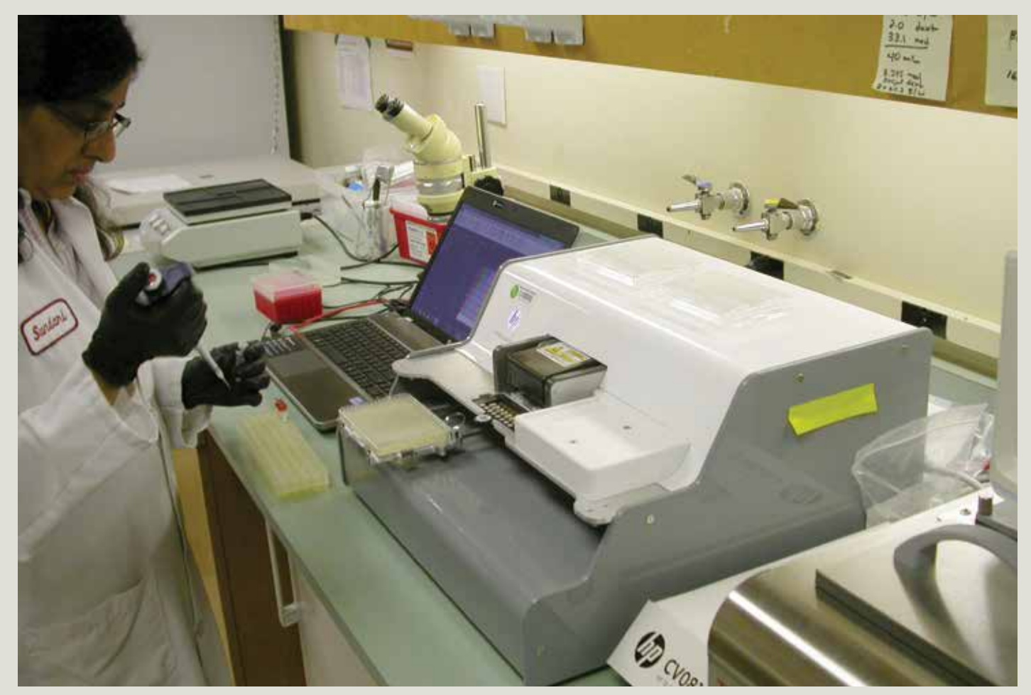
Research Assistant Sundari Suresh using the SGTC's HP D300

to cellular metabolism – are conserved. For example, some cancer drugs, which target specific proteins in tumor cells, target the same proteins in yeast cells. There are also experimental tools that are available in yeast, but not in other systems. We have a knockout strain for each and every gene in yeast, and the effects of small molecules on all of these strains can be examined. The strains can be assayed individually, or collectively as a pool of knock-out strains in a single culture.