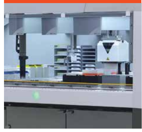
Simultaneous parallel movements of task-specific arms enhance speed and throughput