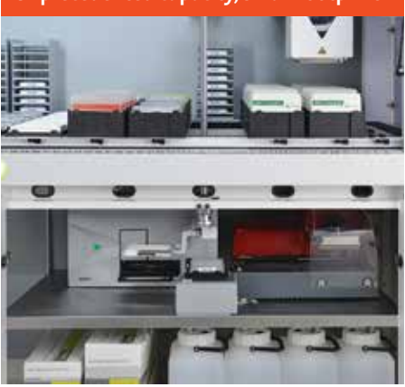
The Dynamic Deck offers unrivalled capacity and optimum efficiency for device integration