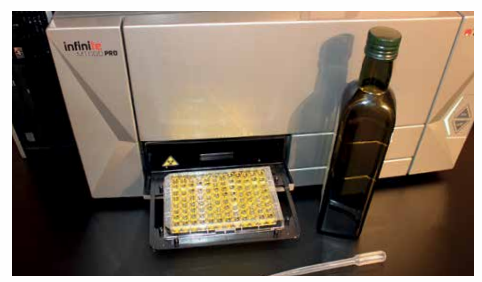
Surveillant's label-free technique relies on the Infinite M1000 PRO's ability to create consistent fluorescence spectra

The simplicity and potential economic benefits of this approach have recently been demonstrated, allowing extra virgin olive oil to be distinguished from olive oil and other edible oils<sup>1</sup>. Fred continued: "The authenticity of extra virgin olive oil is an ongoing concern, with strict production