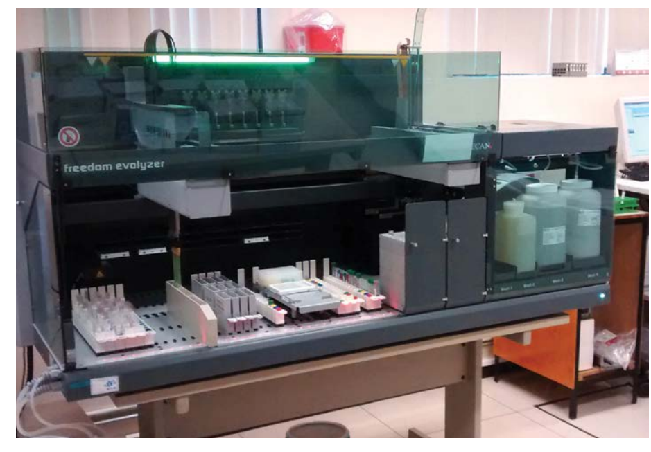
Carperpor's workflow relies on Freedom EVOlyzer and Freedom EVO platforms to automate ELISA testing

attitude is very refreshing; we have always found them to be very flexible to our requirements, and we get an answer to any queries we have within 24 hours. They are certainly in tune with our needs."