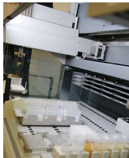
The Freedom EVO allows complete automation of the Atoll MediaScout RoboColumns workflow

For more information on Coherus Biosciences, go to www.coherus.com