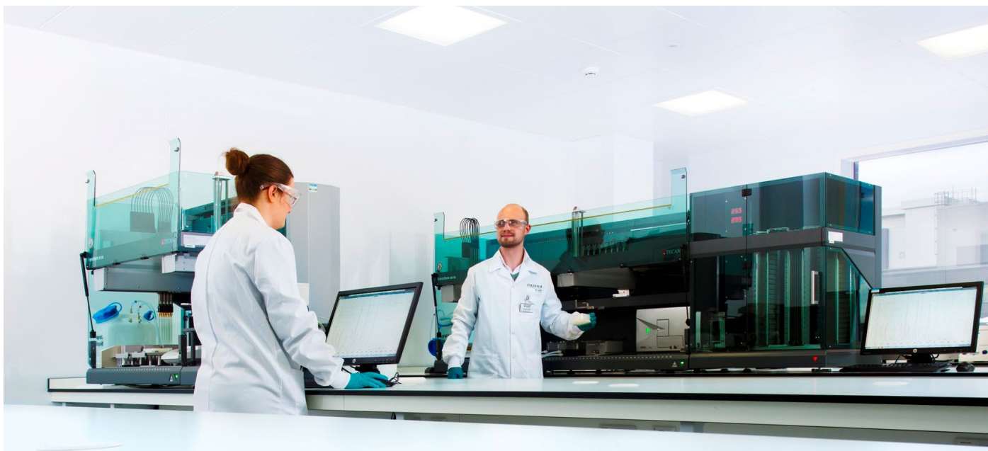
Automated chromatography condition screening helps to generate more data in less time

effects. This process is complex even for large macromolecules derived from mammalian cell lines, such as monoclonal antibodies (mAbs), but is even more difficult when using microbial expression systems. Column chromatography is the method of choice for most biomanufacturing applications, and so we need the ability to screen a wide range of chromatography resins and parameters to ensure high purities and yields for our pharma customers. This is both labor intensive and time consuming to perform manually and so, historically, the scope of these screens has been limited by the development timelines of each project."