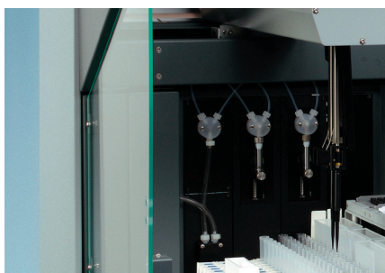
Membrane pump for fast priming of the liquid system