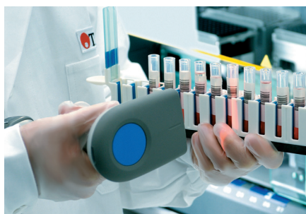
Hand-held barcode scanner for positive identification of sample tubes