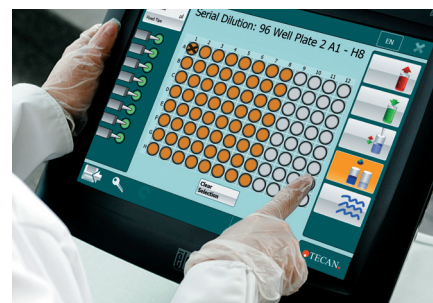
TouchTools Suite™ for instrument operation through a touchscreen

Scientific instrumentation; not for use in human, clinical or diagnostic procedure.