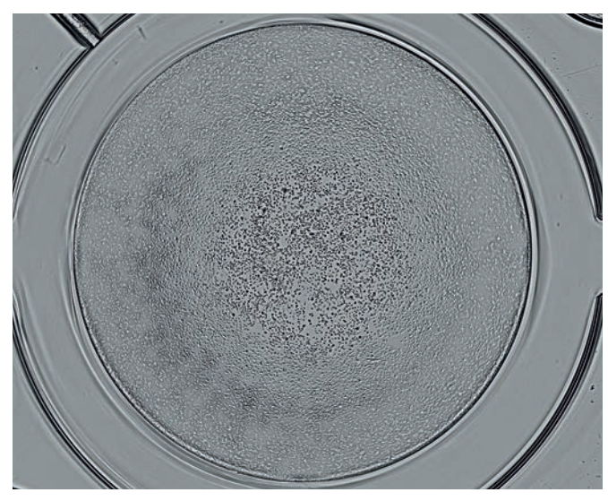
Figure 2: Whole-well view of a 96-well in brightfield, recorded in one field of view – shadow effects resulting from the liquid meniscus are compensated for.

In order to do that, the system needs intelligent detection algorithms that are easy to optimize for each cell type and application, to give you consistent and reliable results from all of your experiments.