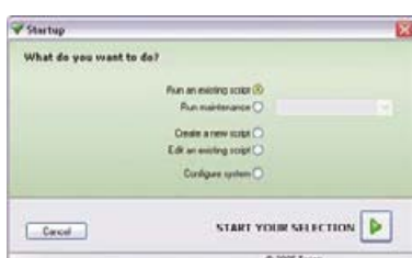
What do you want to do?

1 Existing customers should contact their local Tecan representatives to check for compatibility