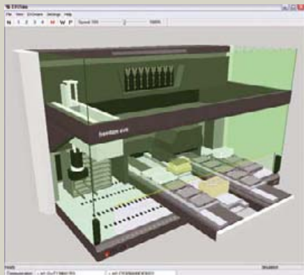
Freedom EVO 96

An overview of the different software packages available, including the new and improved Freedom EVOware v1.2