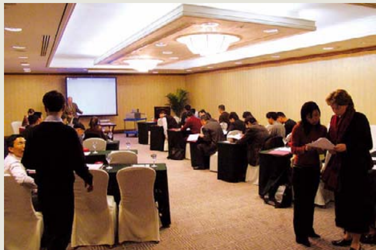
Hands-on training demonstrations for Tecan's distributors