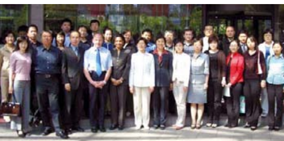
The 28 SFDA participants at the Tecan workshop Tecan Journal 1/2006

We are delighted to have been invited back to China and will continue to use our expertise in training, whether that's in compliance and regulatory issues or in product and software workshops, to build and strengthen relations with customers, business partners and government bodies alike.