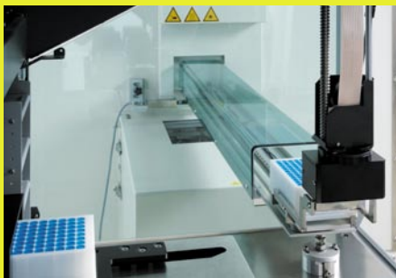
The plate carrier transports samples between the Small-Size Store (SSS) and Freedom EVO

handling is perfectly integrated, making this platform ideal for compound dissolution and reformatting factories, or genomic sample factories.