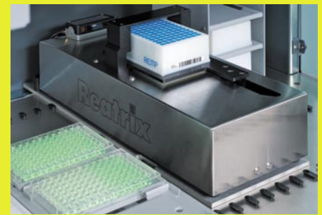
The REMP Reatrix 2D Scanner can be used on-board the Freedom EVO