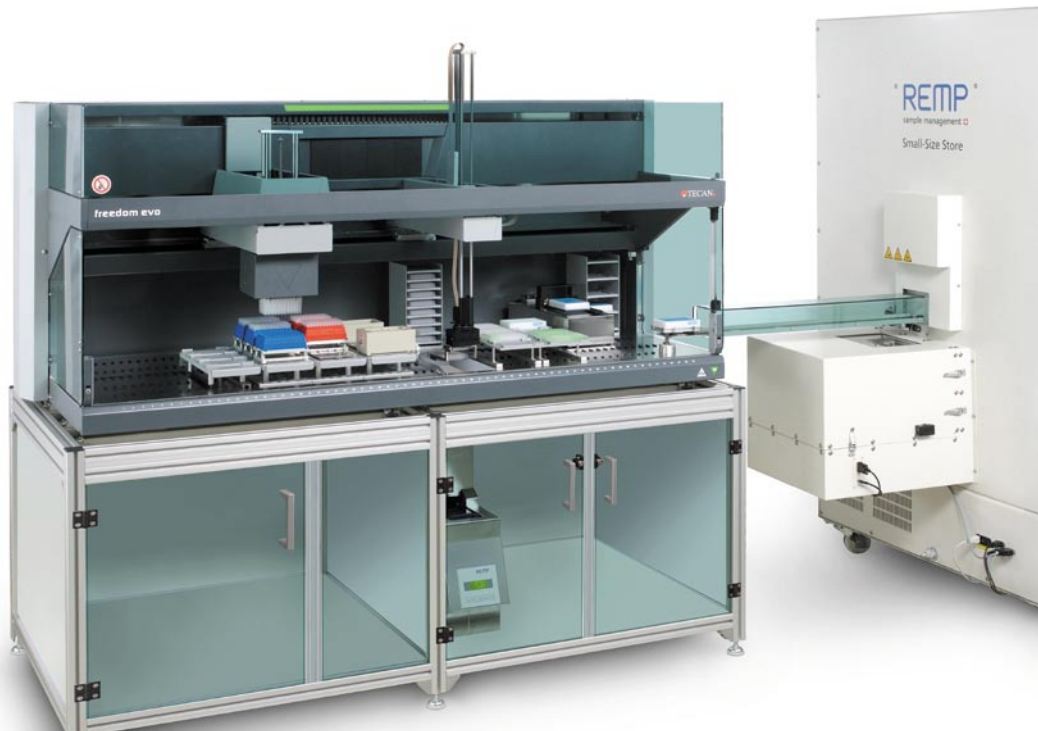
Fully integrated Freedom EVO and REMP Small-Size Store (SSS)

It can handle samples in a variety of formats, including microplates and the REMP Tube Technology ™ Consumables. Integration of the SSS with the Freedom EVO and Freedom EVOware ® enables walkaway operation for sample retrieval and processing steps. REMP Tube Technology enables desired samples to be cherry picked within the store's controlled environment. The samples are easily transferred to Tecan's Freedom EVO workstation using an integrated plate shuttle. Samples are decapped using the REMP ACD96 ™ and processed as required on the Freedom EVO workstation. Upon completion, the samples are subsequently capped and returned to storage when they are no longer needed. The combination of the sample storage and processing platform minimizes the time that samples are exposed to the environment and ensures they are returned to the SSS as soon as processing is completed.