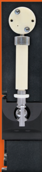
New pump shown with 1.25ml syringe

The innovative new robot provides users with the security of knowing exactly what the product is doing and where the pipetting probe is located at all times, minimizing probe positioning error. Its simple design promises the same robustness and reliability that is characteristic of Tecan's products, while its modularity offers superior flexibility, making the new robot easily configurable for many different applications. The new robot is designed for easy integration, being both easy to install and to operate, making it the ideal OEM robotics component choice. It is encased so that all working parts are hidden to sport a finished professional appearance.