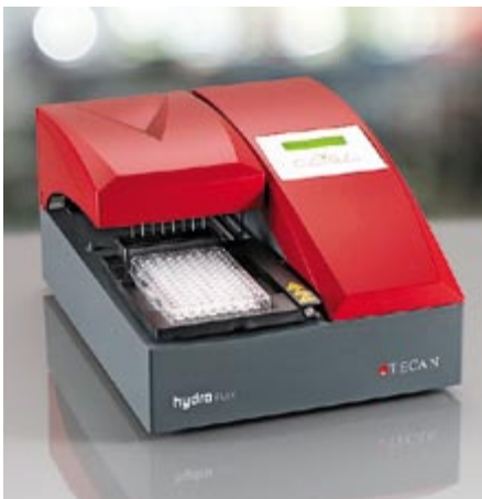
The Tecan HydroFlex system

VBC-Genomics Bioscience Research was founded in Vienna, Austria, in 1999, as a spin-off company from Vienna University, and was established for providing microarray-based genetic research and screening tools. The company currently focuses on developing microarrays to screen for large numbers of allergens, in order to identify the specific triggers of individual patients' allergic reactions. VBC-Genomics has already launched a panel of 89 different allergens that allows rapid, one-step allergy testing from a single drop of blood; the latest version of this product, which will be called ImmunoCAP® ISAC® (Immuno Solid-phase Allergen Chip), will be launched later this year in co-operation with Phadia, Sweden. Phadia is the global market leader for in vitro allergy diagnosis and one of VBC-Genomics' major shareholders.