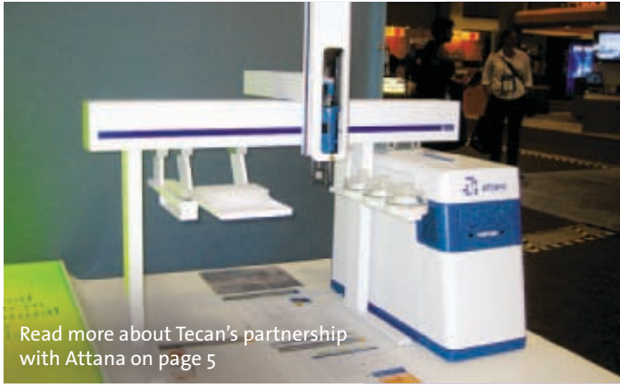
Read more about Tecan's partnership with Attana on page 5