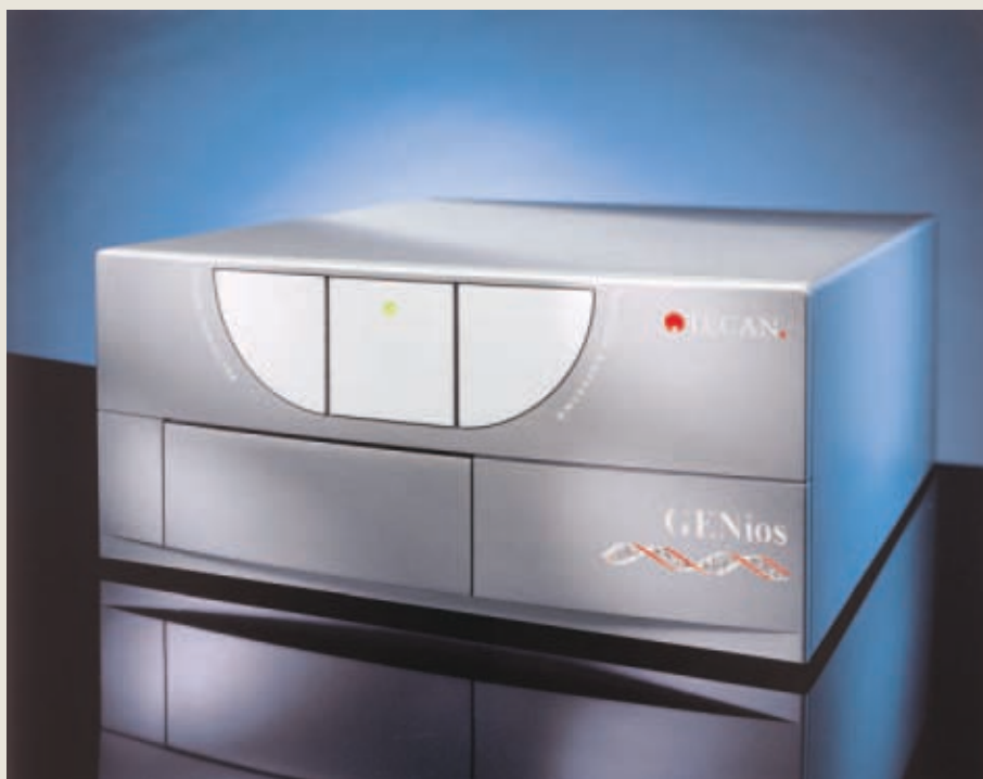
Tecan GENios multimode reader