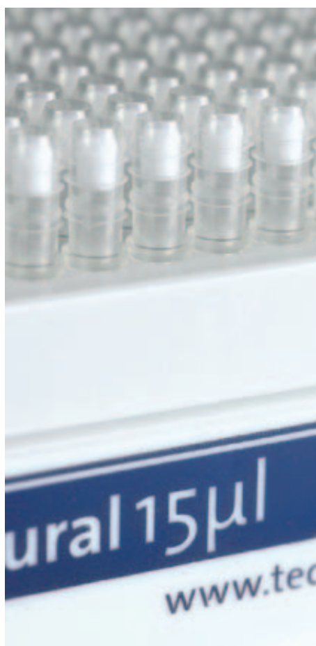
New 15 µl MCA 384 Disposable Tips with filter

Tecan has launched a new generation of high quality MCA 384 Disposable Tips designed to optimize the performance and reliability of the versatile MultiChannel Arm™ (MCA) 384 pipetting option on Freedom EVO® workstations. The all new range of MCA 384 Disposable Tips has been extended to include a 15 µl tip size alongside the existing 50 µl and 125 µl sizes, providing high quality, reliable pipetting across a broad volume range.