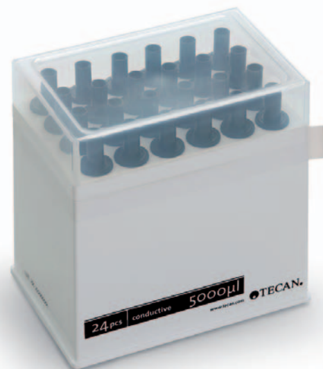
Rack of 5 ml disposable tips for LiHa Arm