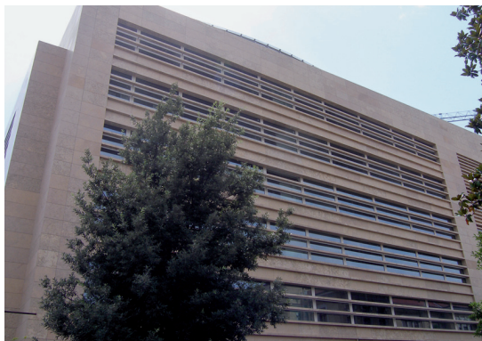
The National Institute of Molecular Genetics, Milan

"By fully automating the DELFIA method on the Freedom EVO workstation, we are now able to perform in one day what it used to take us three days to do."