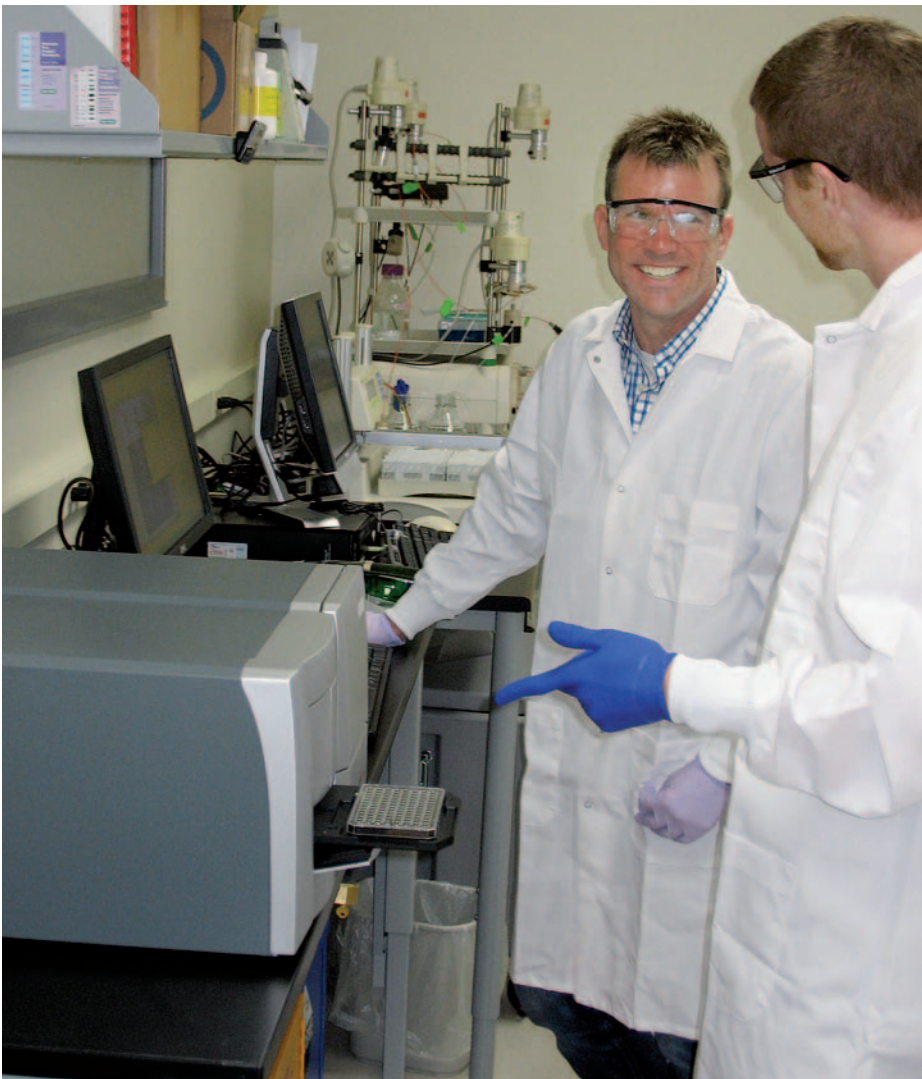
The Infinite F500 offers a high performance, cost-effective solution for BoTest and BoCell assays

"We tested microplate readers from several manufacturers, and the Infinite F500 from Tecan was clearly the best match for our