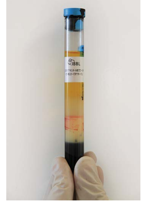
The PBMCs are extracted from centrifuged whole blood

To learn more about IBBL, go to www.ibbl.lu