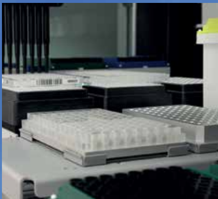
The platform is preconfigured to allow complete automation of library preparation for various NGS chemistries