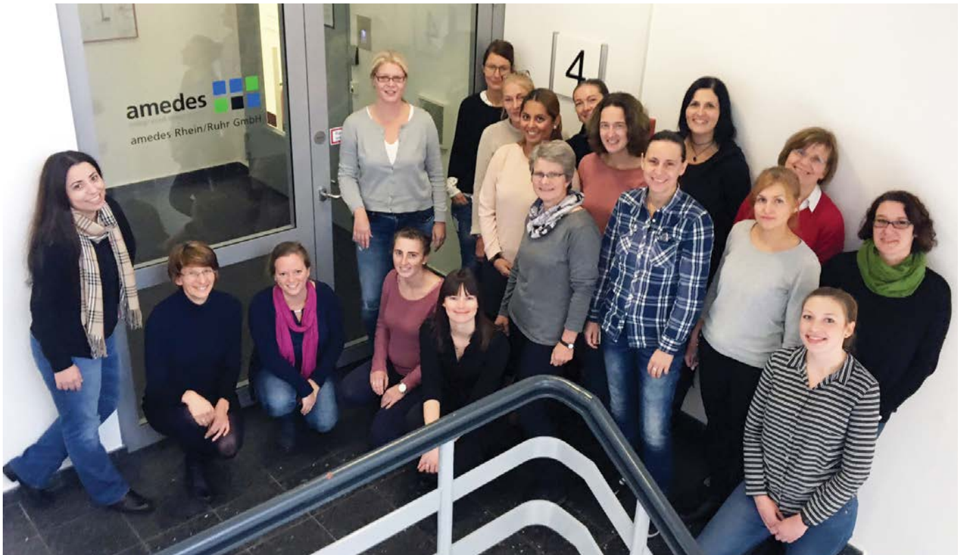
The amedes team

sequencing, and array technologies – as well as cytogenetics by routine analysis of G-banded chromosomes and fluorescence in situ hybridization (FISH). In the past, this work has been done manually. However, with sample numbers continually rising and a need to reduce the time to results without compromising on quality, optimizing our processes to make the workflow as efficient as possible was essential. Automation was the logical way forward.”