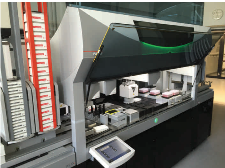
Two Fluent workstations are the latest additions to Roche's core automation facility

"Our automated systems are centralized in a core facility with dedicated technicians to organize and program them, providing a service for all 80 researchers in the department. As most of the assays don't require a high throughput approach, we have decided to use each instrument for multiple assays. We operate nine Tecan instruments – seven Freedom EVO® and two Fluent® instruments – and the two identical Fluent systems can each run 16 or 17 different assay scripts. Different people from the department use the instruments on a weekly or fortnightly basis, and they can book either system using an electronic calendar when a slot is available; one person can run one assay in the morning, and someone else an entirely different assay in the afternoon. Researchers are responsible for running their assays, but we help the process along by hosting the equipment and supporting them to optimize the